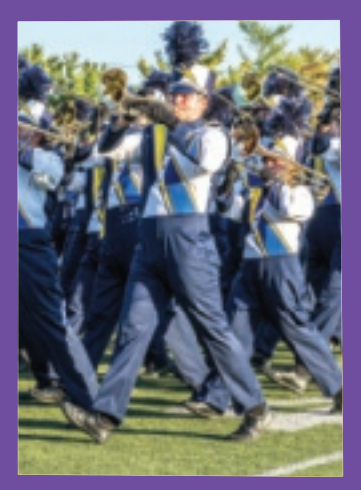
University of Delaware