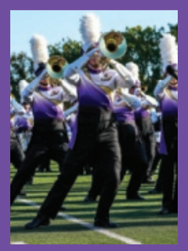
West Chester University